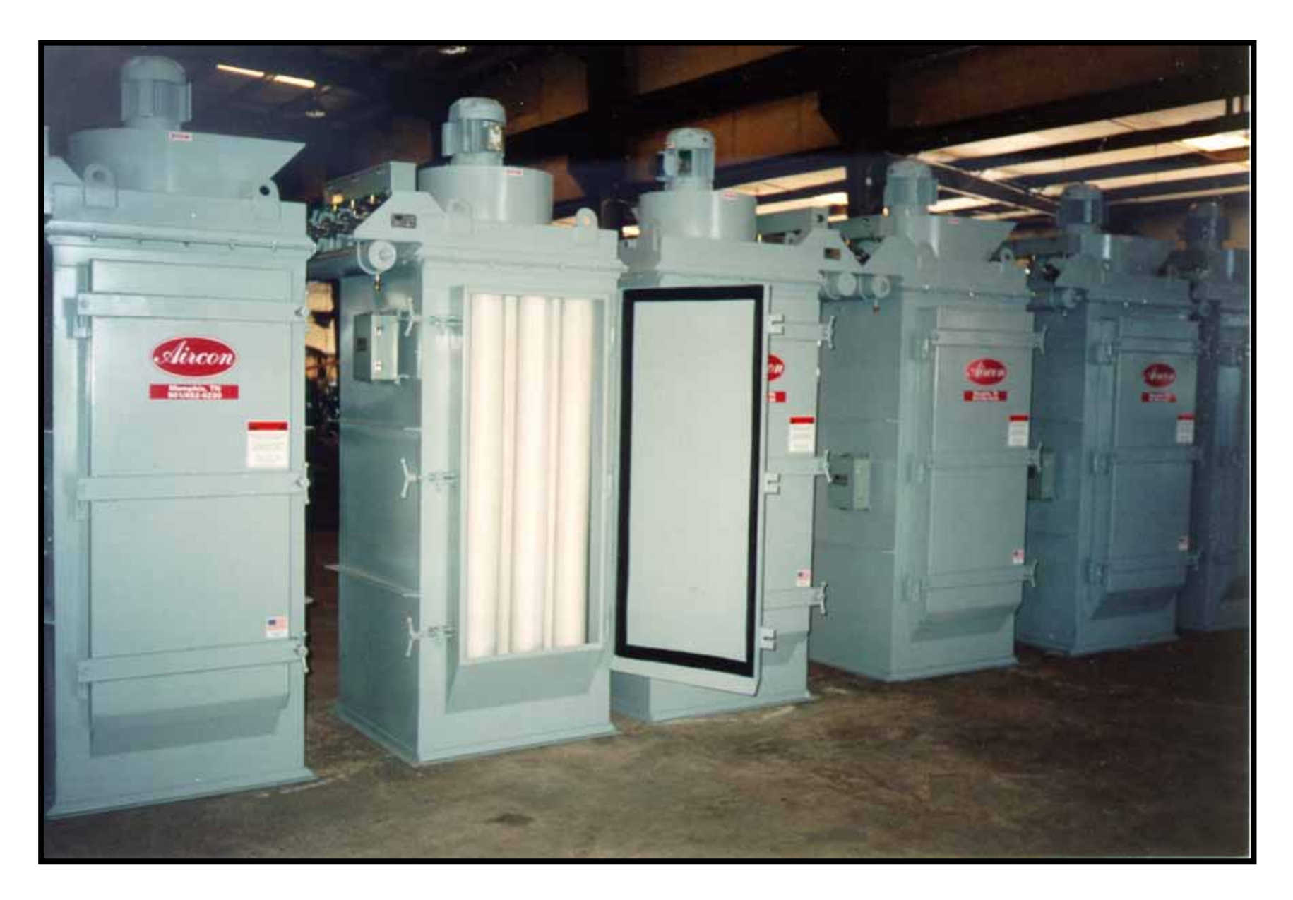
BIN VENTS - STANDARD ORIENTATION TOP-MOUNTED FAN, BOTTOM BAG REMOVAL w/ HINGED ACCESS DOOR